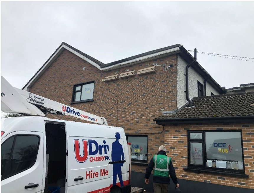
Boxes at the Dee Hub Ardee