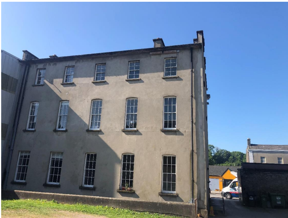
Two triple nestboxes and caller at Barlow house Drogheda