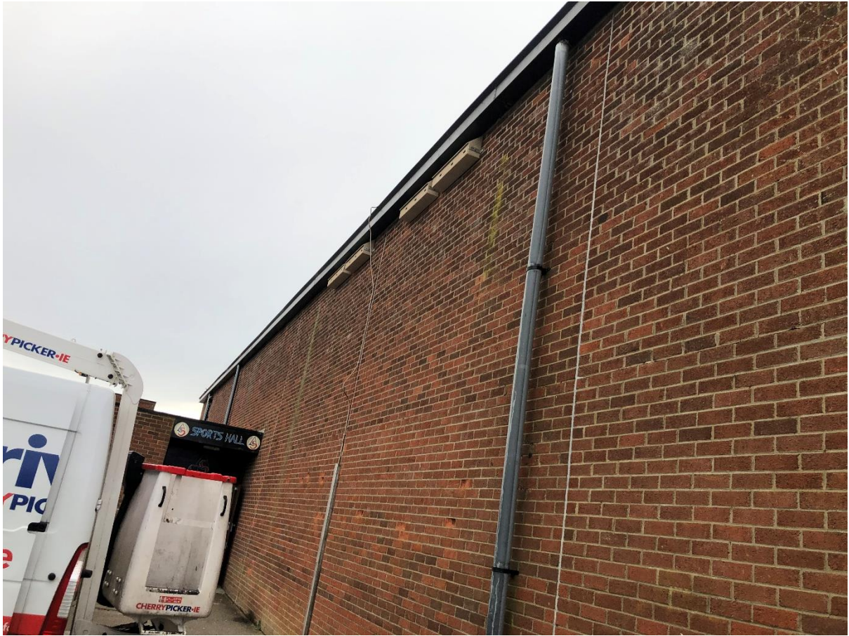
Swift nest boxes at Ardee Community School.