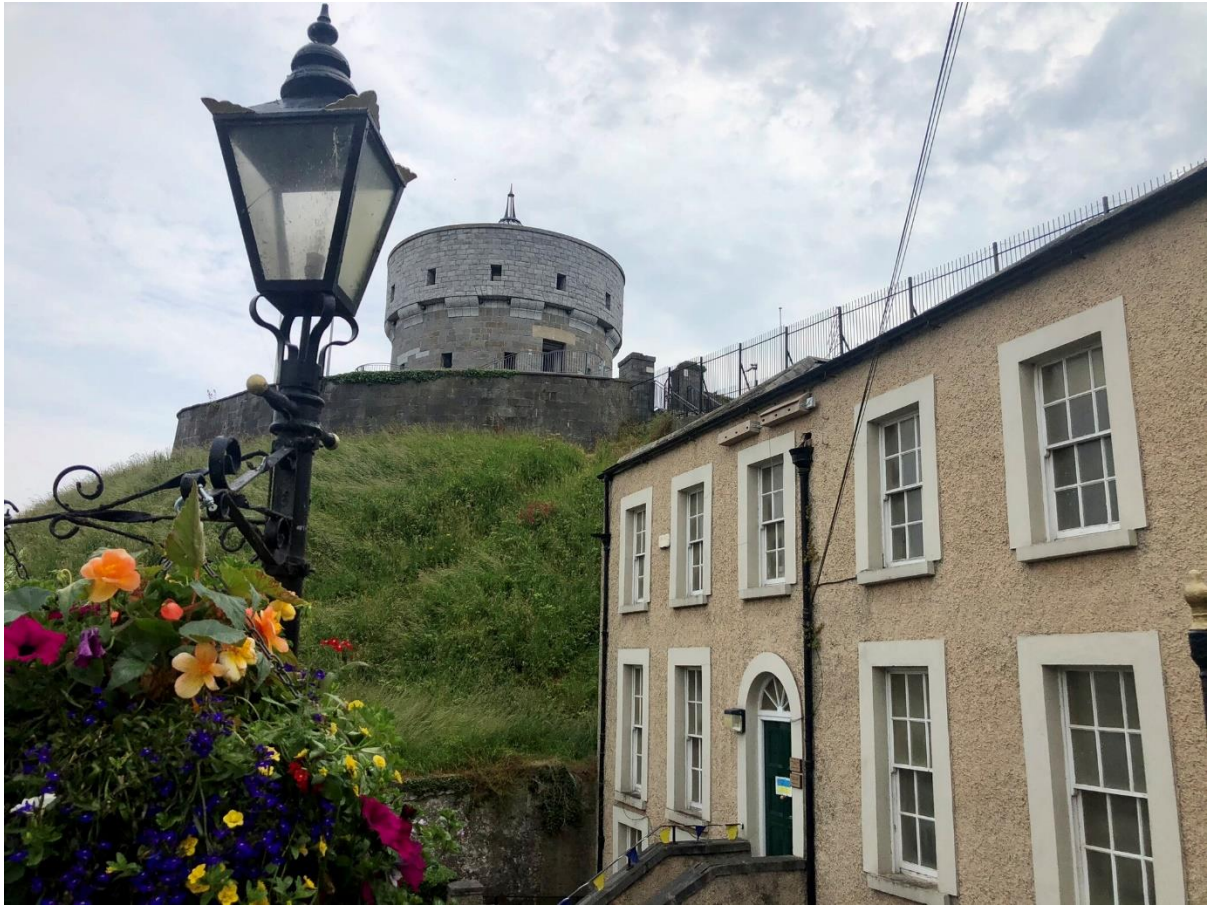
Nestboxes and caller at Millmount in Drogheda