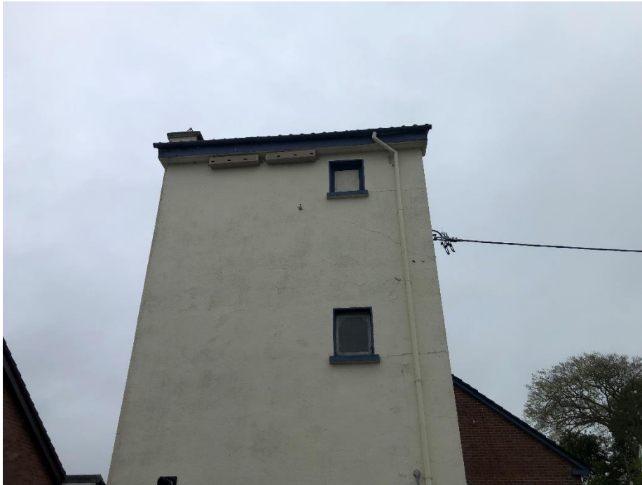
Swift boxes at Tallanstown National School

To date (December 2024) the Louth Swift Group have erected 133 Swift nesting holes.