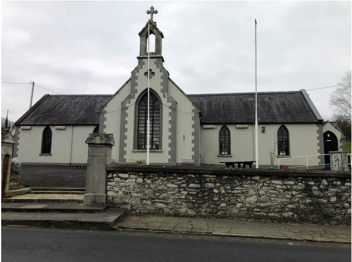
Four triple boxes and caller at the Dolmen centre Omeath.